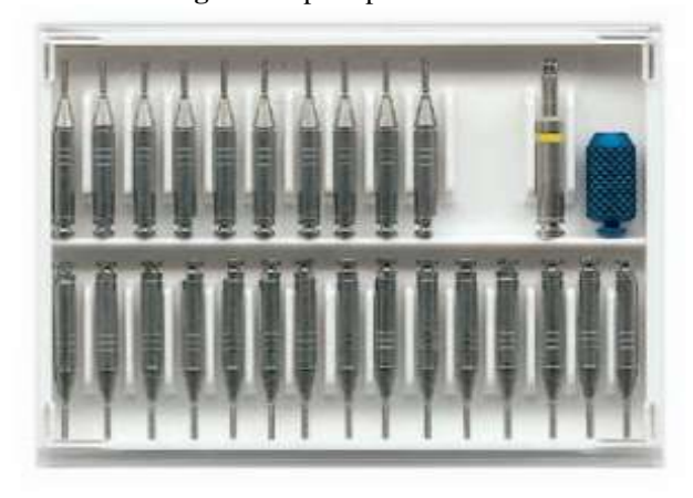
Figure 2 – Trijet retention pins