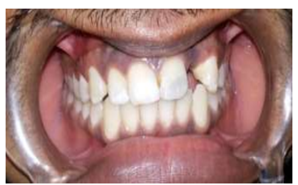
Figure 4 – final restoration